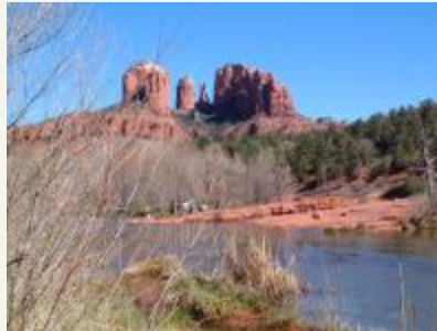
The red rock of Sedona.

mark since the 1970's. Its vine covered stucco walls, cobblestoned walkways and magnificent arched entryways give you the feeling that Tlaquepaque has been here for