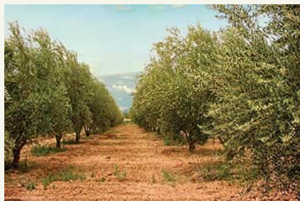
Olive trees at the Queen Creek Olive Mill

Queen Creek Olive Mill —At the base of the San Tan Mountains in Queen Creek's storied farm community the Queen Creek Olive Mill is Arizona's only working olive farm and mill. While they produce a boutique