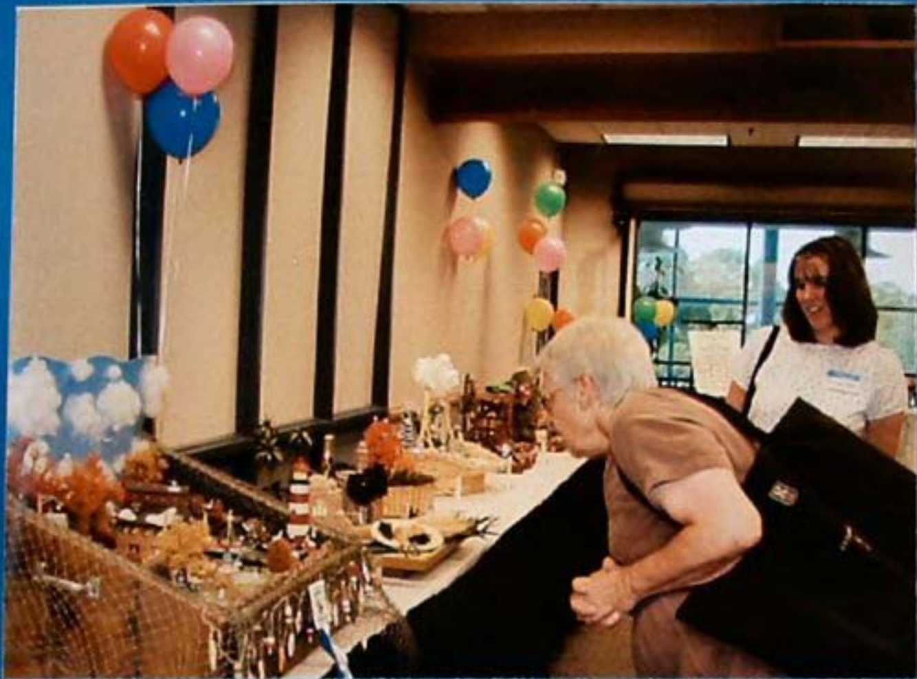
Admiring displays at Northern Lights NewMember Rush Aug. 05.