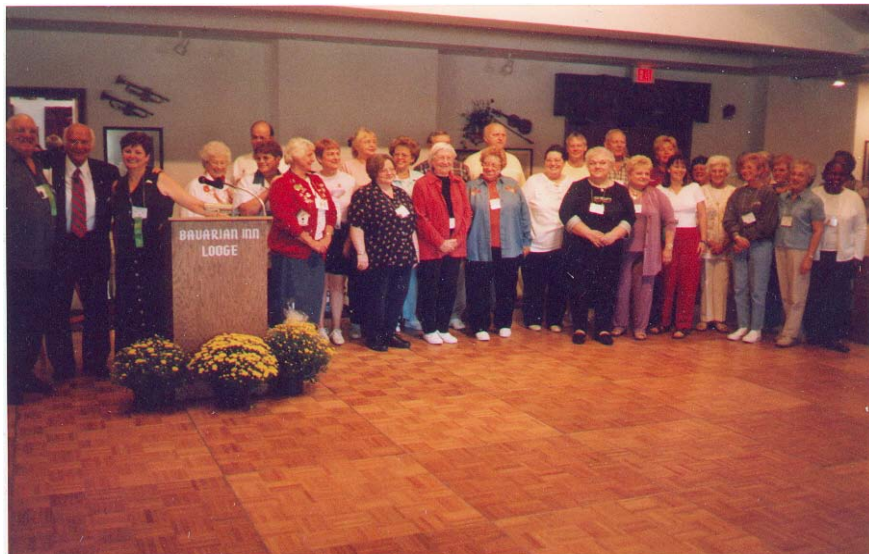
Taken at the MI Gathering 2003 in Frankenmuth, MI. The picture includes the volunteers who worked on the Gathering.