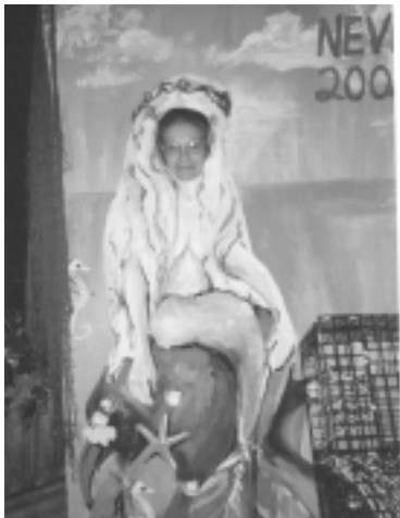
Our very own "Fish called Wanda"