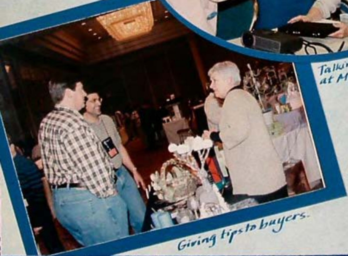
Giving tips to buyers.