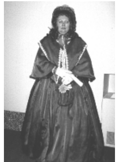
The Silver Anniversary