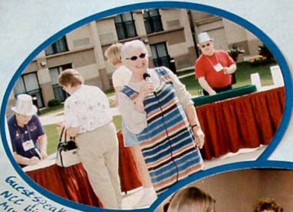
Guest speaker at NCC Birthday @ Minnesota Gathering 2002.