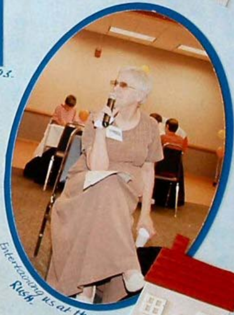
Entertaining us at the Rush.