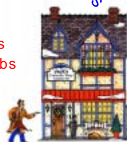
“Jack’s Umbrella Shop”— NCC 10th Anniversary