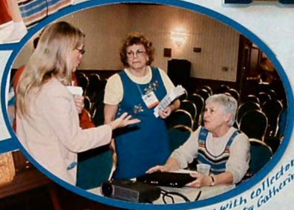
Talking with collectors at Minnesota Gathering